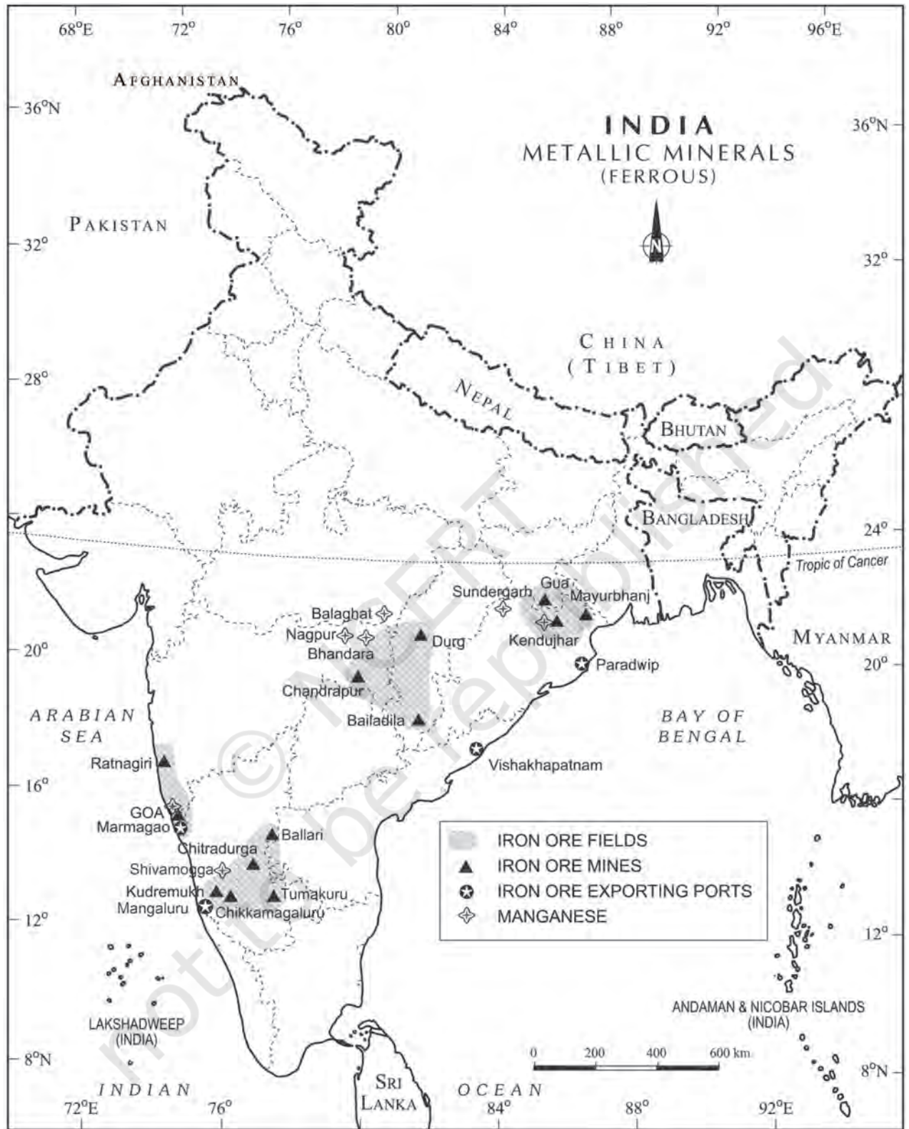
Fig. 5.2 : India – Metallic Minerals (Ferrous)