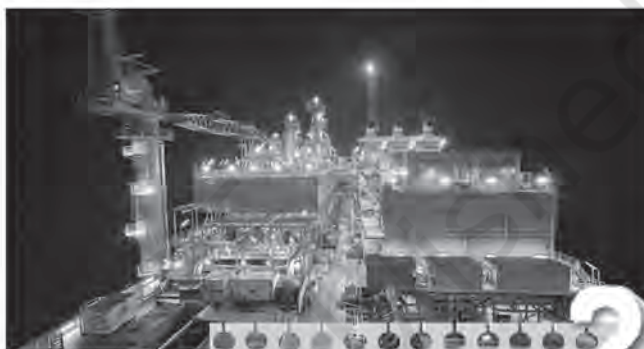
ONGC commences its first oil production from Kakinada coast on January 7.

The block will help increase ONGC's total production of oil and natural gas by 11% and 15% respectively; peak production of the field is expected to be around 45,000 barrels of oil per day and over 10 MMSCMD of gas.