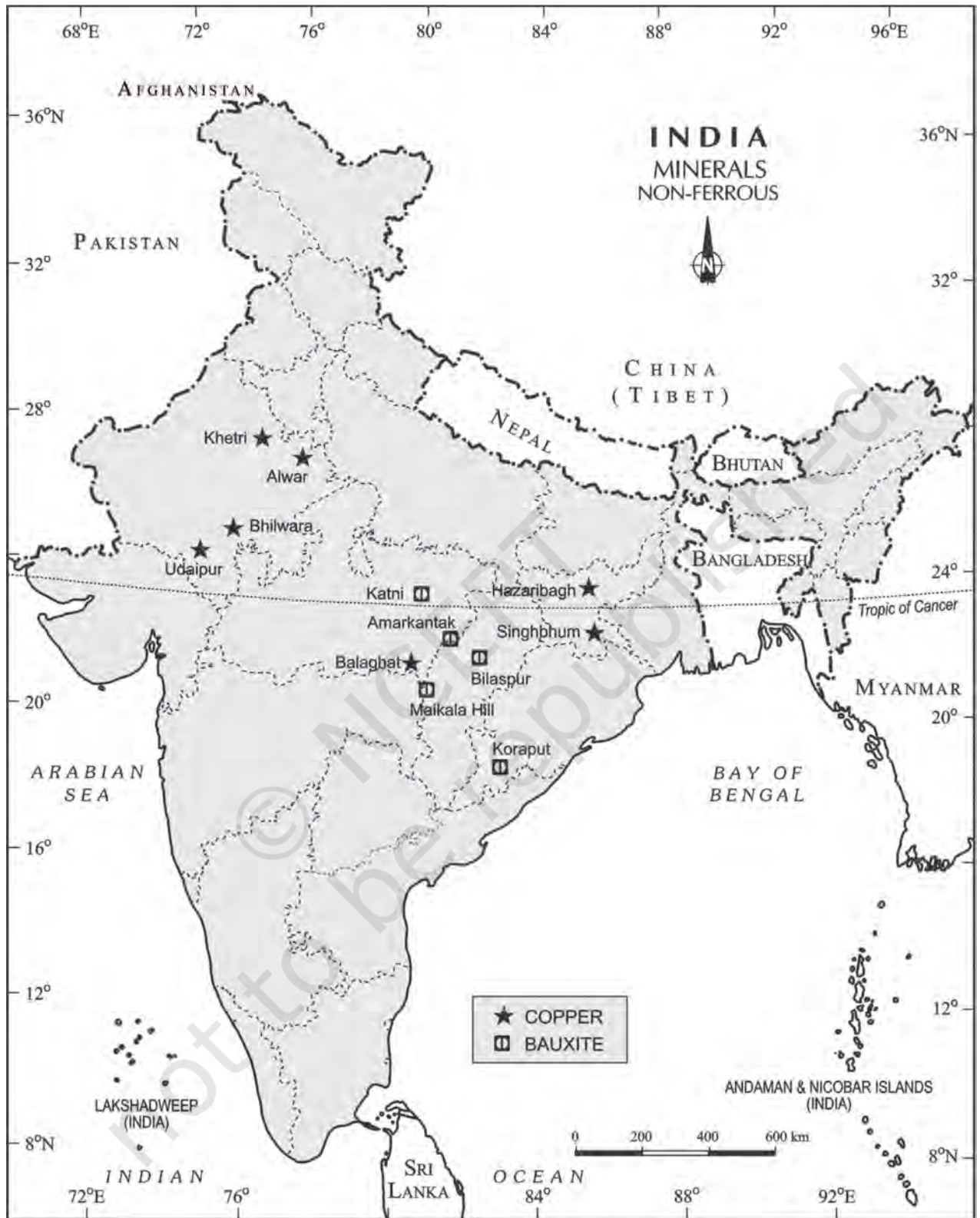
Fig. 5.3 : India – Minerals (Non-Ferrous)