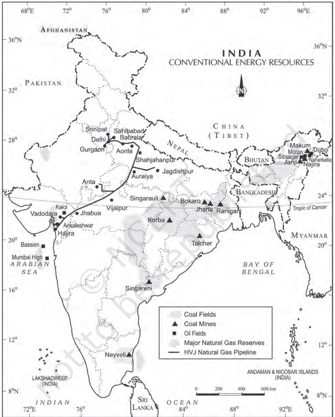
Fig. 5.4 : India – Conventional Energy Resources

Activity: Collect information about cross country natural gas pipelines laid by GAIL (India) under 'One Nation One Grid'.