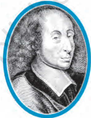
Blaise Pascal (1623-1662)

In earlier classes, we have learnt how to find the squares and cubes of binomials like a + b and a - b . Using them, we could evaluate the numerical values of numbers like (98)^2 = (100 - 2)^2 , (999)^3 = (1000 - 1)^3 , etc. However, for higher powers like (98)^5 , (101)^6 , etc., the calculations become difficult by using repeated multiplication. This difficulty was overcome by a theorem known as binomial theorem. It gives an easier way to expand (a + b)^n , where n is an integer or a rational number. In this Chapter, we study binomial theorem for positive integral indices only.