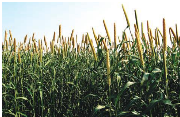
Fig. 4.6: Bajra Cultivation

Millets: Jowar, bajra and ragi are the important millets grown in India. Though, these are known as coarse grains, they have very high nutritional value. For example, ragi is very rich in iron, calcium, other micro nutrients and roughage. Jowar is the third most important food crop with respect to area and production. It is a rain-fed crop mostly grown in the moist areas which hardly needs irrigation. Major Jowar producing States are Maharashtra, Karnataka, Andhra Pradesh and Madhya Pradesh.