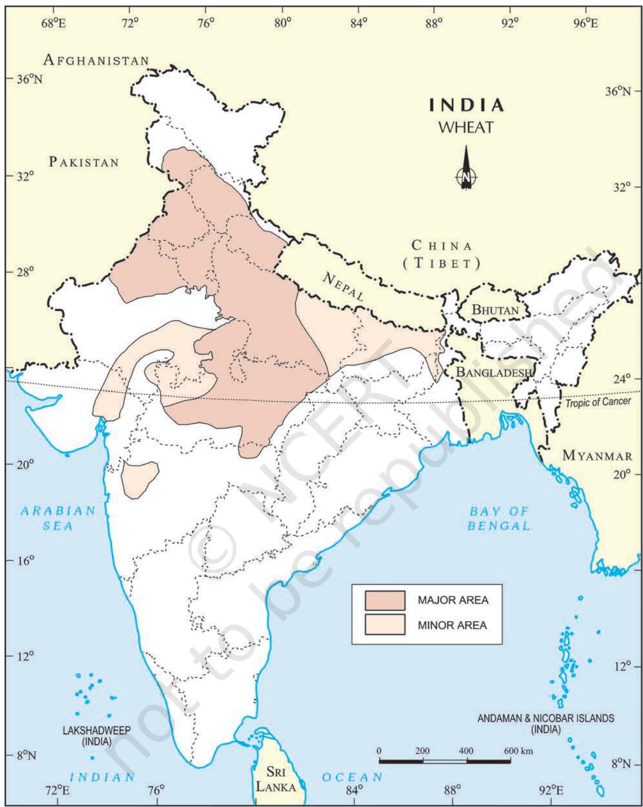
India: Distribution of Wheat