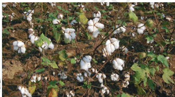
Fig. 4.14: Cotton Cultivation

Cotton: India is believed to be the original home of the cotton plant. Cotton is one of the main raw materials for cotton textile industry. India is second largest producer of cotton after China. Cotton grows well in drier parts of the black cotton soil of the Deccan plateau. It requires high temperature, light rainfall or irrigation, 210 frost-free days and bright sun-shine for its growth. It is a kharif crop and requires 6 to 8 months to mature. Major cotton-producing states are—