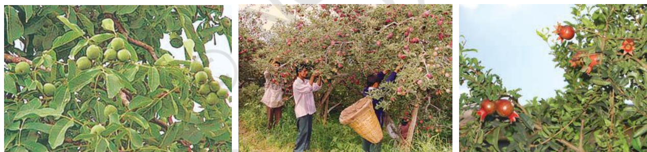
Fig. 4.12: Apricots, apple and pomegranate

Horticulture Crops: In 2020, India was the second largest producer of fruits and vegetables in the world after China. India is a producer of tropical as well as temperate fruits. Mangoes of Maharashtra, Andhra Pradesh, Telangana, Uttar Pradesh and West Bengal, oranges of Nagpur and Cherrapunjee (Meghalaya), bananas of Kerala, Mizoram, Maharashtra and Tamil Nadu, lichi and guava of Uttar Pradesh and Bihar, pineapples of Meghalaya, grapes of Andhra Pradesh, Telangana and Maharashtra, apples, pears, apricots and walnuts of Jammu and Kashmir and Himachal Pradesh are in great demand the world over.