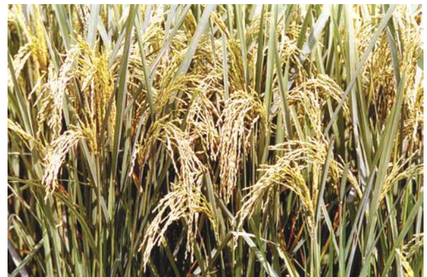
Fig. 4.4 (b): Rice is ready to be harvested in the field