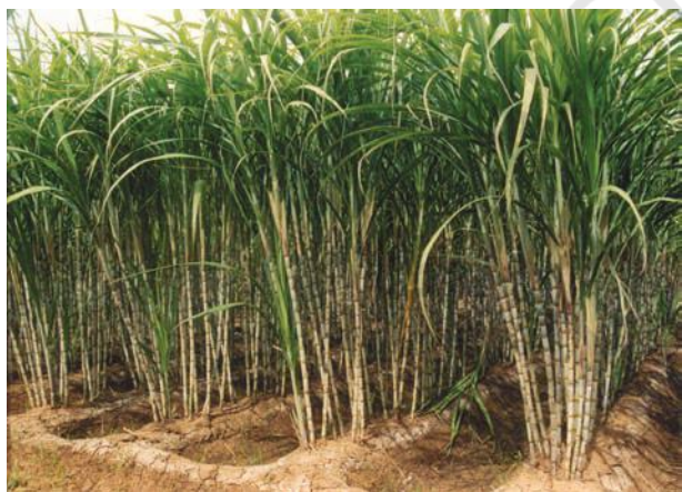
Fig. 4.8: Sugarcane Cultivation

Sugarcane: It is a tropical as well as a subtropical crop. It grows well in hot and humid climate with a temperature of 21°C to 27°C and an annual rainfall between 75cm. and 100cm. Irrigation is required in the regions of low rainfall. It can be grown on a