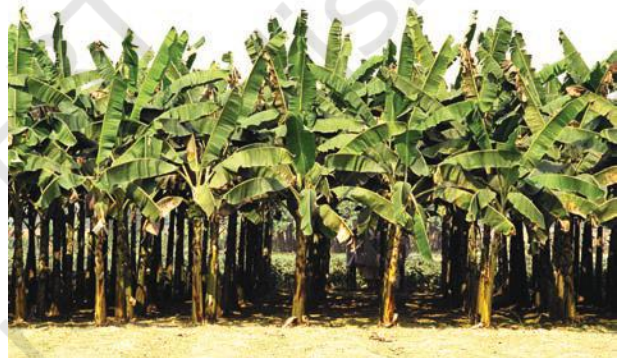
Fig. 4.2: Banana plantation in Southern part of India

In India, tea, coffee, rubber, sugarcane, banana, etc., are important plantation crops. Tea in Assam and North Bengal coffee in Karnataka are some of the important plantation crops grown in these states. Since the production is mainly for market, a well-developed network of transport and communication connecting the plantation areas, processing industries and markets plays an important role in the development of plantations.