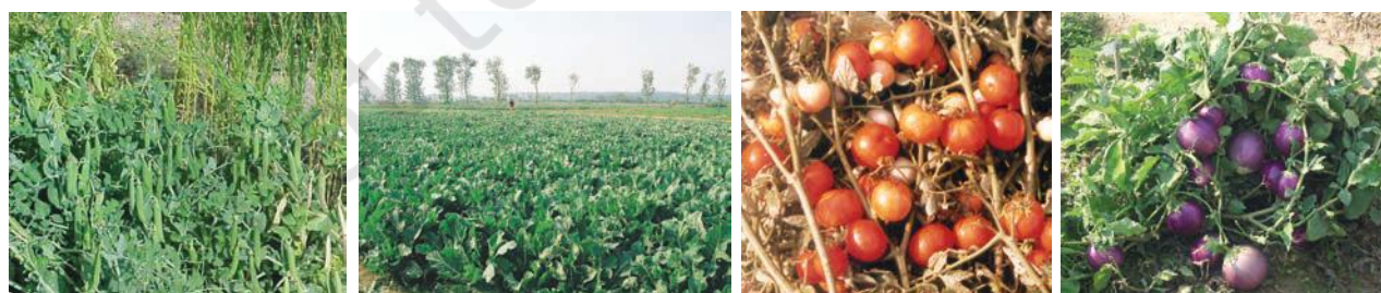
Fig. 4.13: Cultivation of vegetables – peas, cauliflower, tomato and brinjal