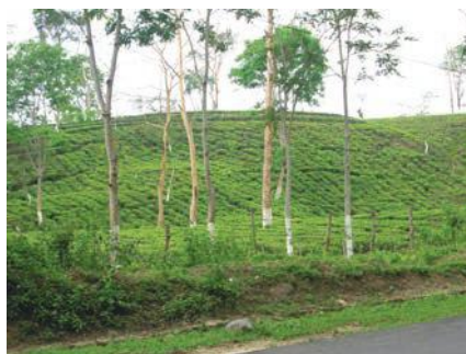
Fig. 4.10: Tea Cultivation

Coffee: Indian coffee is known in the world for its good quality. The Arabica variety initially brought from Yemen is produced in the country. This variety is in great demand all over the world. Initially its cultivation was introduced on the Baba Budan Hills and even today its cultivation is confined to the Nilgiri in Karnataka, Kerala and Tamil Nadu.