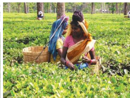
Fig. 4.11: Tea-leaves Harvesting

Horticulture Crops: In 2020, India was the second largest producer of fruits and vegetables in the world after China. India is a producer of tropical as well as temperate fruits. Mangoes of Maharashtra, Andhra Pradesh, Telangana, Uttar Pradesh and West Bengal, oranges of Nagpur and Cherrapunjee (Meghalaya), bananas of Kerala, Mizoram, Maharashtra and Tamil Nadu, lichi and guava of Uttar Pradesh and Bihar, pineapples of Meghalaya, grapes of Andhra Pradesh, Telangana and Maharashtra, apples, pears, apricots and walnuts of Jammu and Kashmir and Himachal Pradesh are in great demand the world over.