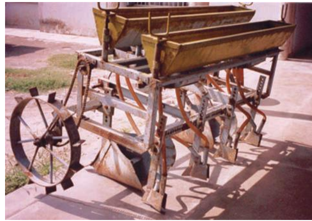
Fig. 4.15: Modern technological equipments used in agriculture

reforms. Provision for crop insurance against drought, flood, cyclone, fire and disease, establishment of Grameen banks, cooperative societies and banks for providing loan facilities to the farmers at lower rates of interest were some important steps in this direction.