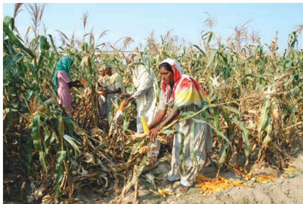
Fig. 4.7: Maize Cultivation

Maize: It is a crop which is used both as food and fodder. It is a kharif crop which requires temperature between 21°C to 27°C and grows well in old alluvial soil. In some states like Bihar maize is grown in rabi season also. Use of modern inputs such as HYV seeds, fertilisers and irrigation have contributed to the increasing production of maize. Major maize-producing states are Karnataka, Madhya Pradesh, Uttar Pradesh, Bihar, Andhra Pradesh and Telangana.