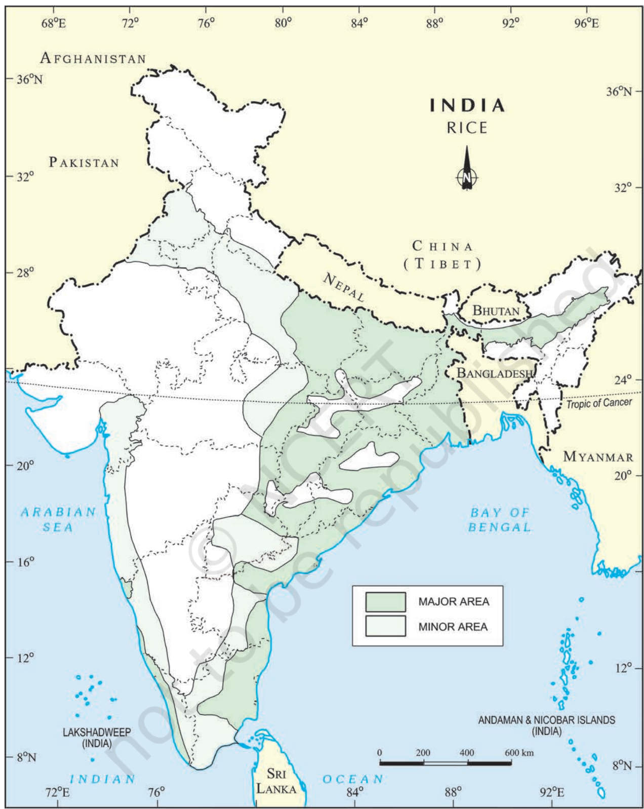
India: Distribution of Rice