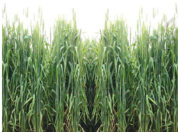
Fig. 4.5: Wheat Cultivation

Wheat: This is the second most important cereal crop. It is the main food crop, in north and north-western part of the country. This rabi crop requires a cool growing season and a bright sunshine at the time of ripening. It requires 50 to 75 cm of annual rainfall evenly-distributed over the growing season. There are two important wheat-growing zones in the country – the Ganga-Satluj plains in the north-west and black soil region of the Deccan. The major wheat-producing states are Punjab, Haryana, Uttar Pradesh, Madhya Pradesh, Bihar and Rajasthan.