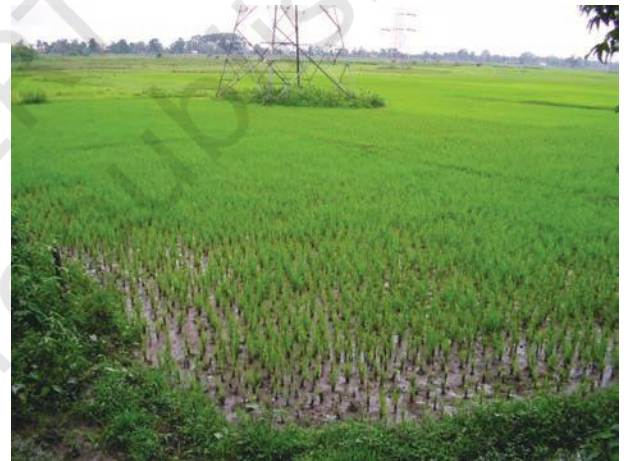
Fig. 4.4 (a): Rice Cultivation

Rice: It is the staple food crop of a majority of the people in India. Our country is the second largest producer of rice in the world after China. It is a kharif crop which requires high temperature, (above 25°C) and high humidity with annual rainfall above 100 cm. In the areas of less rainfall, it grows with the help of irrigation.