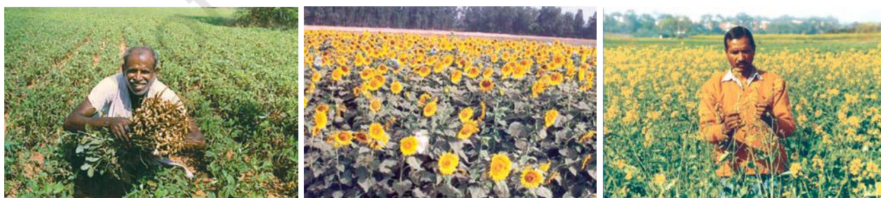
Fig. 4.9: Groundnut, sunflower and mustard are ready to be harvested in the field

Tea: Tea cultivation is an example of plantation agriculture. It is also an important beverage crop introduced in India initially by the British. Today, most of the tea plantations are owned by Indians. The tea plant grows well in tropical and sub-tropical climates endowed with deep and fertile well-drained soil, rich in humus and organic matter. Tea bushes require warm and moist frost-free