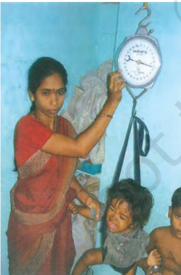
Weighing of a Child