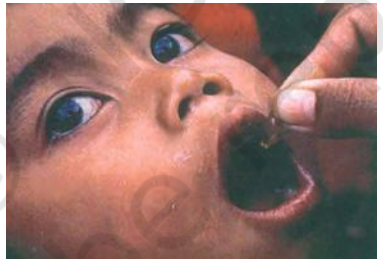
Iron and Folic acid drops