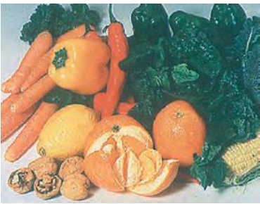
Yellow, green & orange fruits and vegetables are good source of Vitamin A