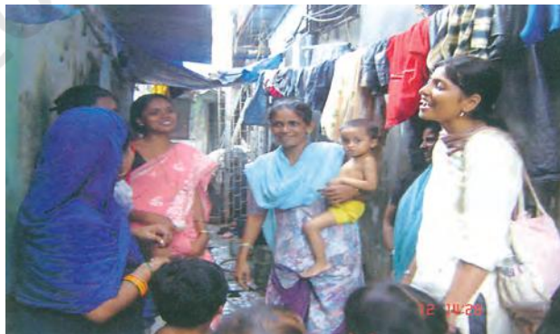
Counselling with mothers