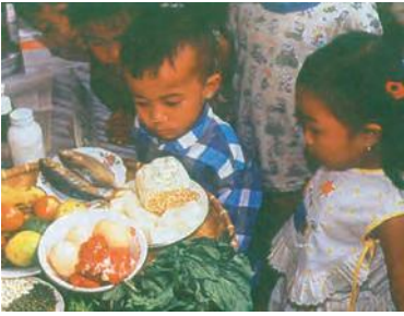
Providing nutritious food