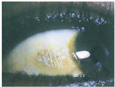
Vitamin A deficiency picture of eye