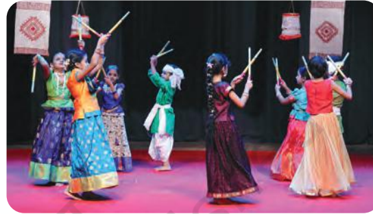
Kolata — Karnataka

Dance together to the rhythm of your favourite festival song.