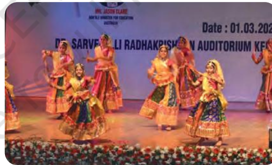
Garba — Navratri, Gujarat