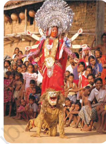
Purulia Chhau — Lion Dance

You might have observed that different animals have distinct movement styles (such as walking, climbing, sleeping, facial movements, etc.). Similarly, the animal characters described in Panchatantra stories have unique movements. In our country, there are many dances based on animal movements; they are called animal dances for example, 'tiger' dance and 'peacock' dance.