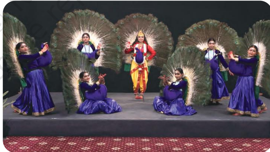
Mayilattam — Peacock Dance