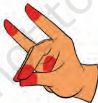
Simha mukha (deer, cow)