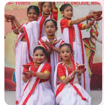
Dhunuchi — Durga Puja, West Bengal