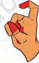
Tamrachuda (bird head)