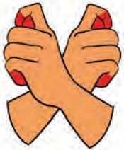
Berunda (eagle head)