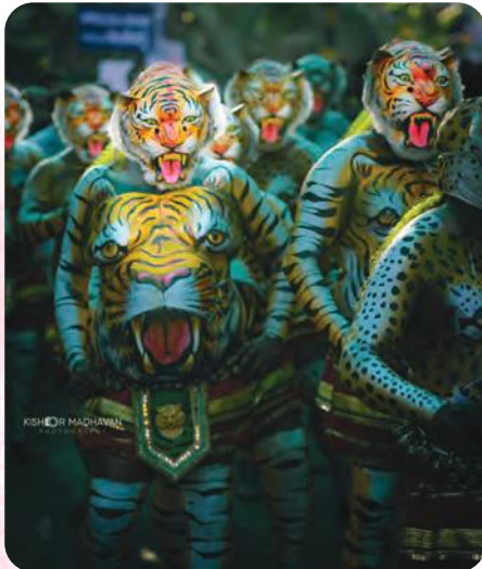
Pulikkali — Tiger Dance