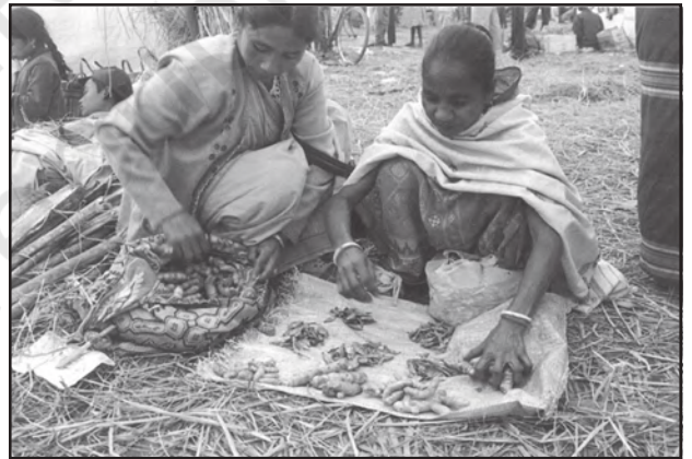
Fig. 8.1: Two women practising barter system in Jon Beel Mela

The initial form of trade in primitive societies was the barter system , where direct exchange of goods took place. In this system if you were a potter and were in need of a plumber, you would have to look for a plumber who would be in need of pots and you could exchange your pots for his plumbing service.