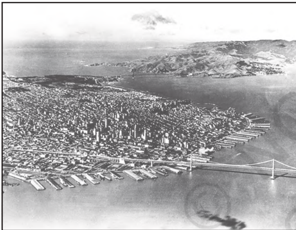
Fig. 8.3: San Francisco, the largest land-locked harbour in the world

The ports provide facilities of docking, loading, unloading and the storage facilities for cargo. In order to provide these facilities, the port authorities make arrangements for maintaining navigable channels, arranging tugs and barges, and providing labour and managerial services. The importance of a port is judged by the size of cargo and the number of ships handled. The quantity of cargo handled by a port is an indicator of the level of development of its hinterland.