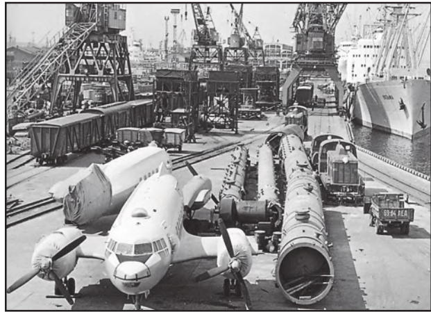
Fig. 8.4: Leningrad Commercial Port