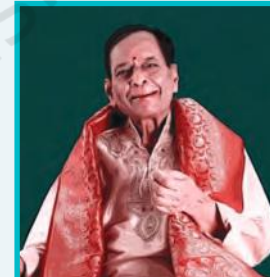
Dr. M. Balamuralikrishna

With vocal exercises like the ones listed above, you can increase your range over time. Artists like Pandit Jasraj, Dr. M. Balamuralikrishna and Parveen Sultana are known for their extensive vocal ranges.