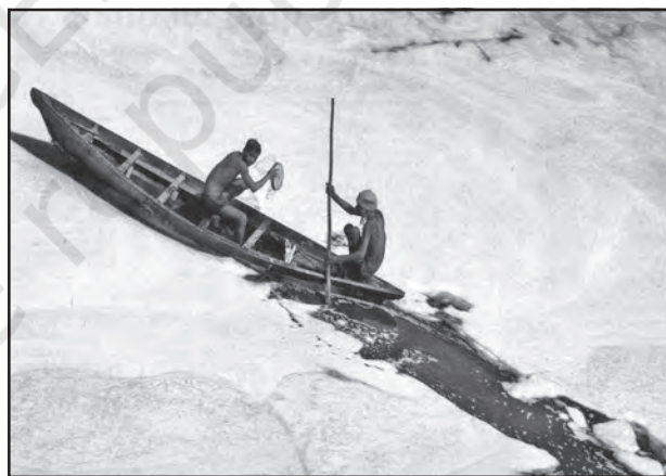
Fig.9.1 : Cutting Through Effluent : Rowing through a pervasive layer of foam on the heavily polluted Yamuna on the outskirts of New Delhi

Indiscriminate use of water by increasing population and industrial expansion has led degradation of the quality of water considerably. Surface water available from rivers, canals, lakes, etc. is never pure. It contains small quantities of suspended particles, organic and inorganic substances. When concentration of these substances increases, the water becomes polluted, and hence becomes unfit for use. In such a situation, the self-purifying capacity of water is unable to purify the water.