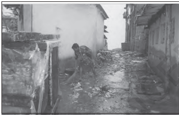
Fig. 9.3 : A view of urban waste in Mahim, Mumbai