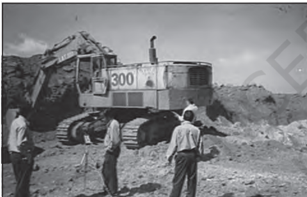
Fig. 9.2 : Noise monitoring at Panchpatmalai Bauxite Mine

The main sources of noise pollution are various factories, mechanised construction and demolition works, automobiles and aircraft, etc. There may be added periodical but polluting noise from sirens, loudspeakers used in various festivals, programmes