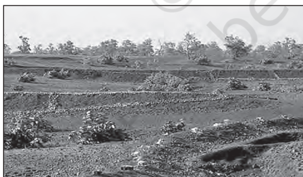
Fig. 9.4 : Trees planted on Common Property Resources in Jhabua

An interesting aspect of this experience is that before the community embarked upon the process of management of the pasture, there was encroachment on this land by a villager from an adjoining village. The villagers called the tehsildar to ascertain the rights of the common land. The ensuing conflict was tackled by the villagers by offering to make the defaulter encroaching on the CPR a member of their user group and sharing the benefits of greening the common lands/pastures. (See the section on CPR in chapter ‘Land Resources and Agriculture’).