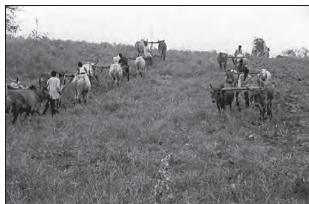
Fig. 9.5 : Community Participation for Land Leveling in Common Property Resources in Jhabua (ASA, 2004)

Source: Evaluation Report, Rajiv Gandhi Mission for Watershed Management, Government of Madhya Pradesh, 2002