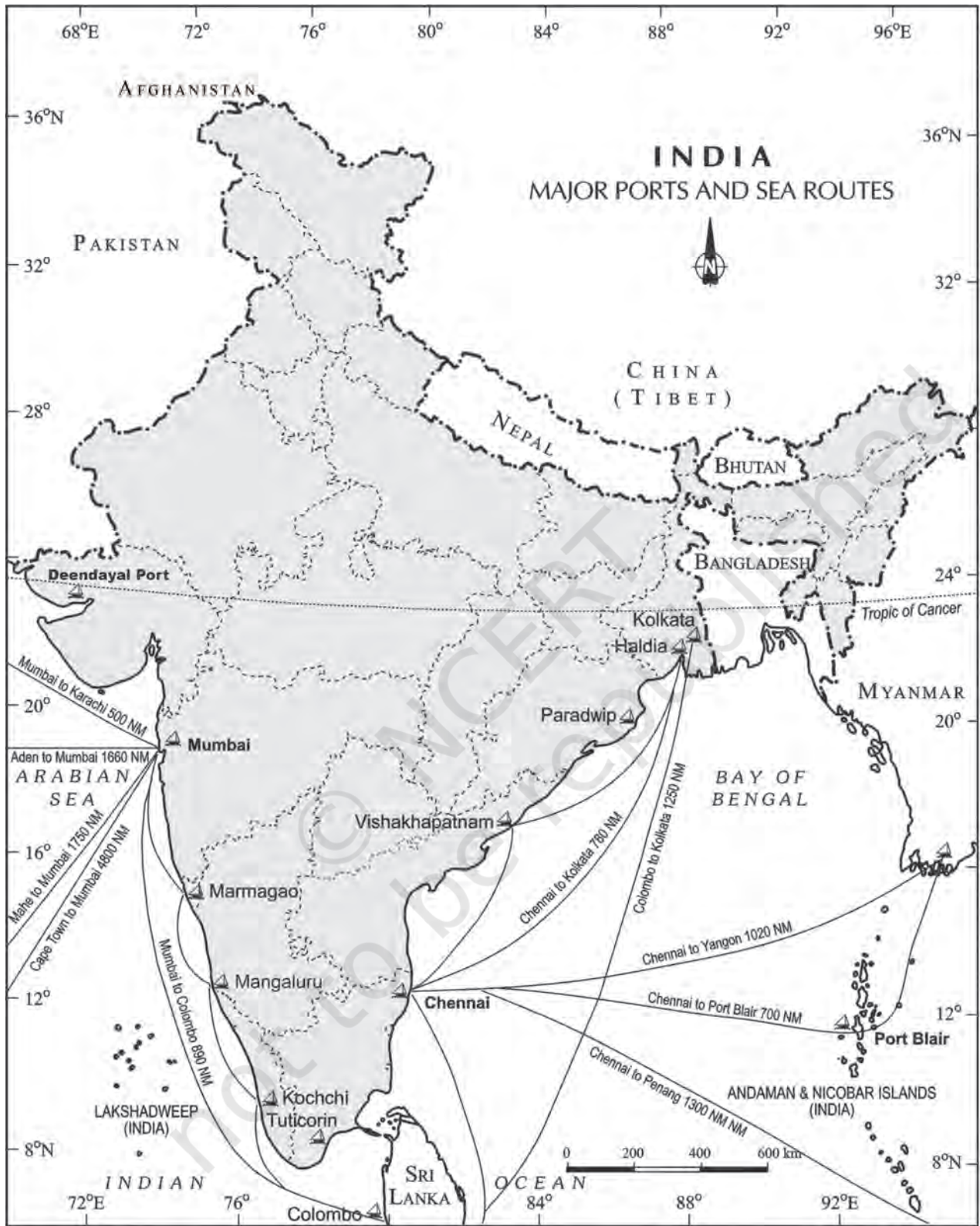
Fig. 8.4 : India - Major Ports and Sea Routes