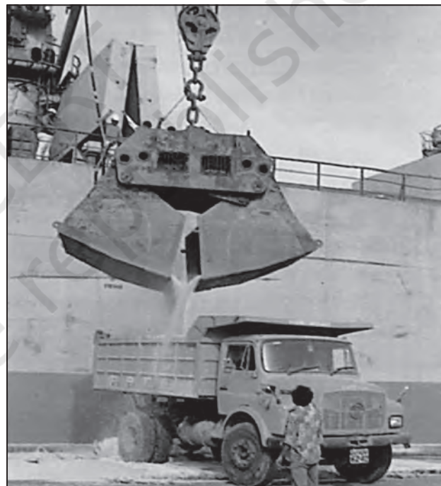
Fig. 8.3 : Unloading of goods on port

India is surrounded by sea from three sides and is bestowed with a long coastline. Water provides a smooth surface for very cheap transport provided there is no turbulence. India