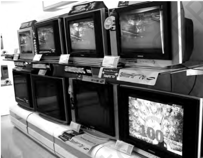
A television showroom