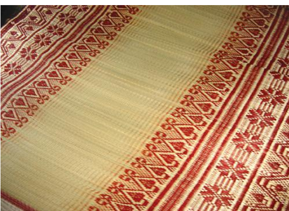
Shital pati, Assam