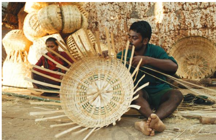
Traditional bamboo craftspersons, Orissa