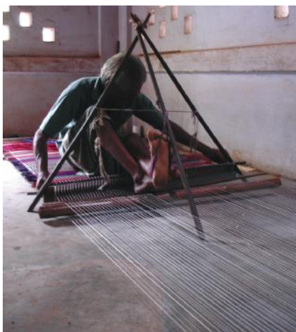
A kora mat weaver on the traditional loom, Tamil Nadu