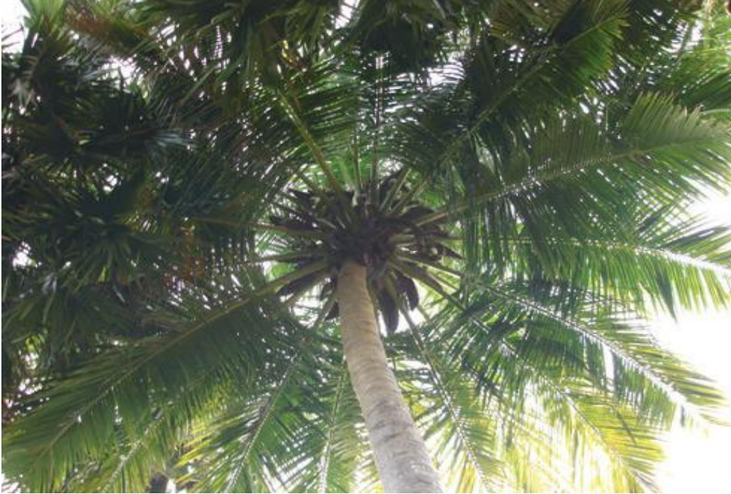
The coconut palm tree grows wild.