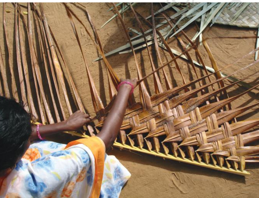
The pinnate or compound leaves being woven together

There are male and female species of the screw pine. The female screw pine produces a finer quality of fibre used in weaving traditional mats called mettha pai which are soft and cool to sleep on. The male screw pine produces coarser fibre. In Thazava in Kollam district of Kerala, double layer mats are made which are edged with a vivid coloured strip used to stitch the layers together. The white mat is burnished with a stone that gives it a polish.