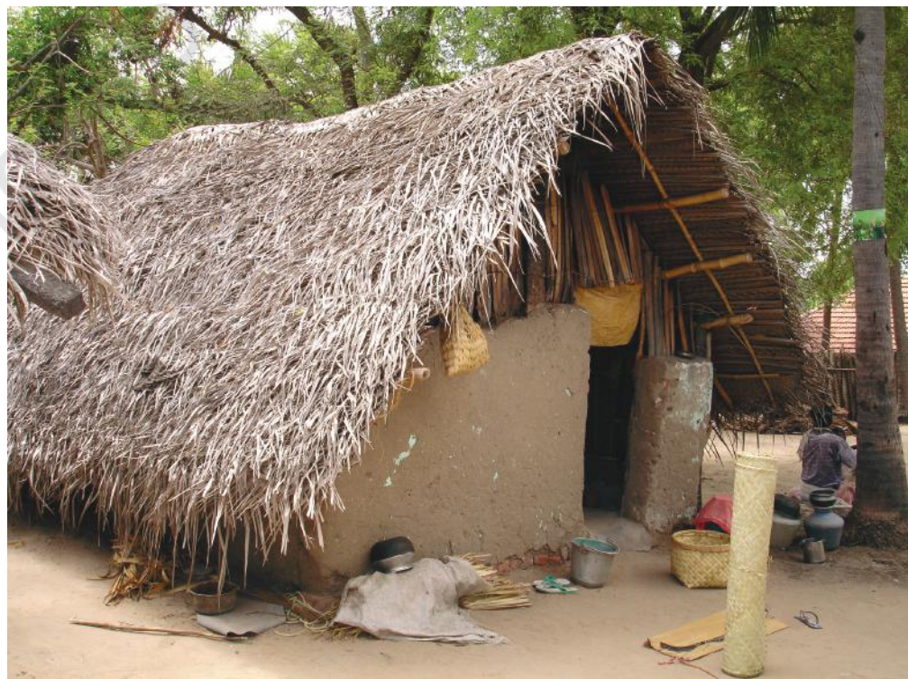
A palm-leaf craftsman's house, Tamil Nadu

The local population of coastal Tamil Nadu is known for judiciously using every part of the palm tree for a wide range of applications—the trunk is used in local architecture and for making rafts; the leaves are used whole as roof thatch and wall panels while strips are woven into baskets, winnowing trays and for packaging fish and jaggery. Palm oil and palm fruit are edible products.