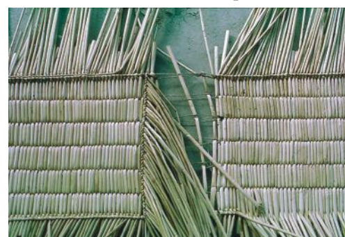
Unfinished reed mat, Manipur

Kauna is the local name for a reed or rush belonging to the family Cyperaceae which is cultivated in the wetlands of the Imphal valley. It has a cylindrical, soft and spongy stem which is woven into mats, square and rectangular cushions and mattresses by the women of the Meitei community of Manipur. The raw material for the craft is obtained by simple processing wherein the reed is cut near the base of the plant and dried in the sun. It is also smoked if it is to be preserved and stored for a longer time. The mats are woven by interlacing the stalks with jute threads using basic and simple tools. The mats and cushions have a unique edge finishing which is done by hand.