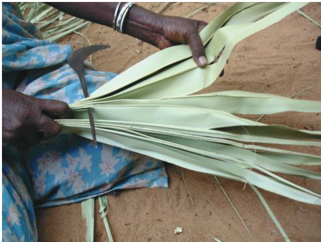
An artisan making strips of the palm leaf by inserting a knife in the leaf fold and separating the leaf from the midrib

A large variety of baskets, containers, mats and furniture are made from the leaves and stem of trees and plants belonging to the palm family.