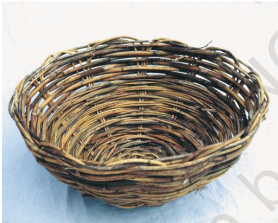
A shallow circular basket made from whole cane