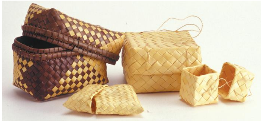
Boxes made of palm strips for various uses