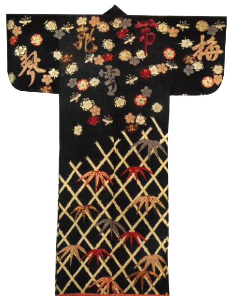
A traditional Japanese kimono

The bamboo and cane crafts of the North Eastern region of India represent a large storehouse of forms and traditional