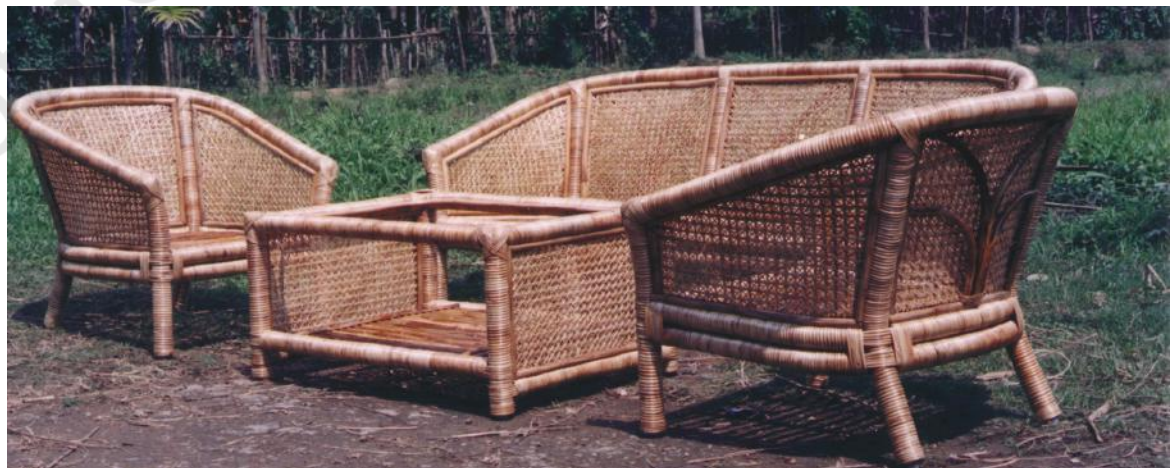
Cane furniture made by skilled craftsmen, Nagaland