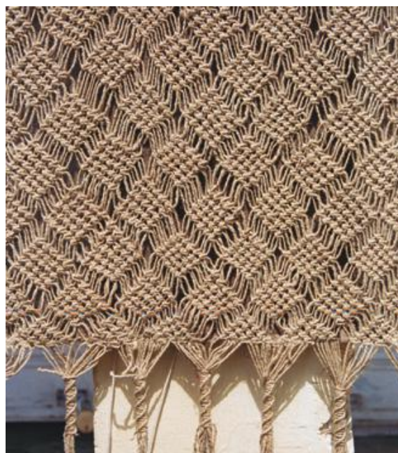
Detail of a contemporary wall panel made with jute yarn using macramé or knotting technique

Bast fibres are generally long fibres. Consequently they are used in making yarn and weaving cloth