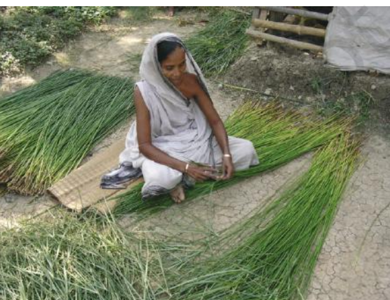
Mat weaver separating the stem of the sedge or kathi from the leaf stalk, West Bengal

Korai (Tamil Nadu) or kora (Kerala) also of the Cyperaceae family is a sedge or wetland plant which is cultivated in the southern districts of Tamil Nadu. The stems are cut near the base of the plant, spliced vertically and dried in the sun. On drying the spliced stems curl into a smooth and tubular form. A large variety of mats—with stripes, geometrical motifs, natural and dyed colours—are woven in several districts of Tamil Nadu and Kerala. The mats are woven on horizontal floor looms. The ribbed natural coloured mats are popularly used as floor coverings.