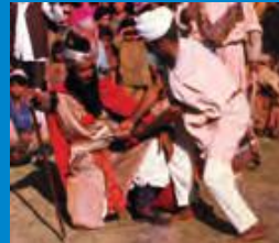
Bandh Pather, Kashmir