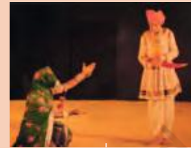
Maach, Madhya Pradesh