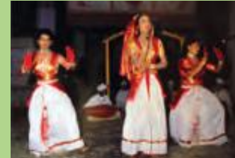
Ankiya Naat, Assam