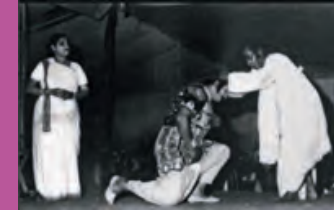
Jaatra, West Bengal