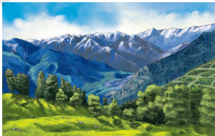
A mountainous region