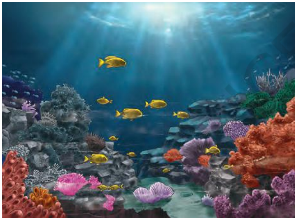
An underwater view of an Ocean

vastness of outer space, from what is cooking in the kitchen to what is happening on the playground, some of the most groundbreaking discoveries have often come from unexpected places.