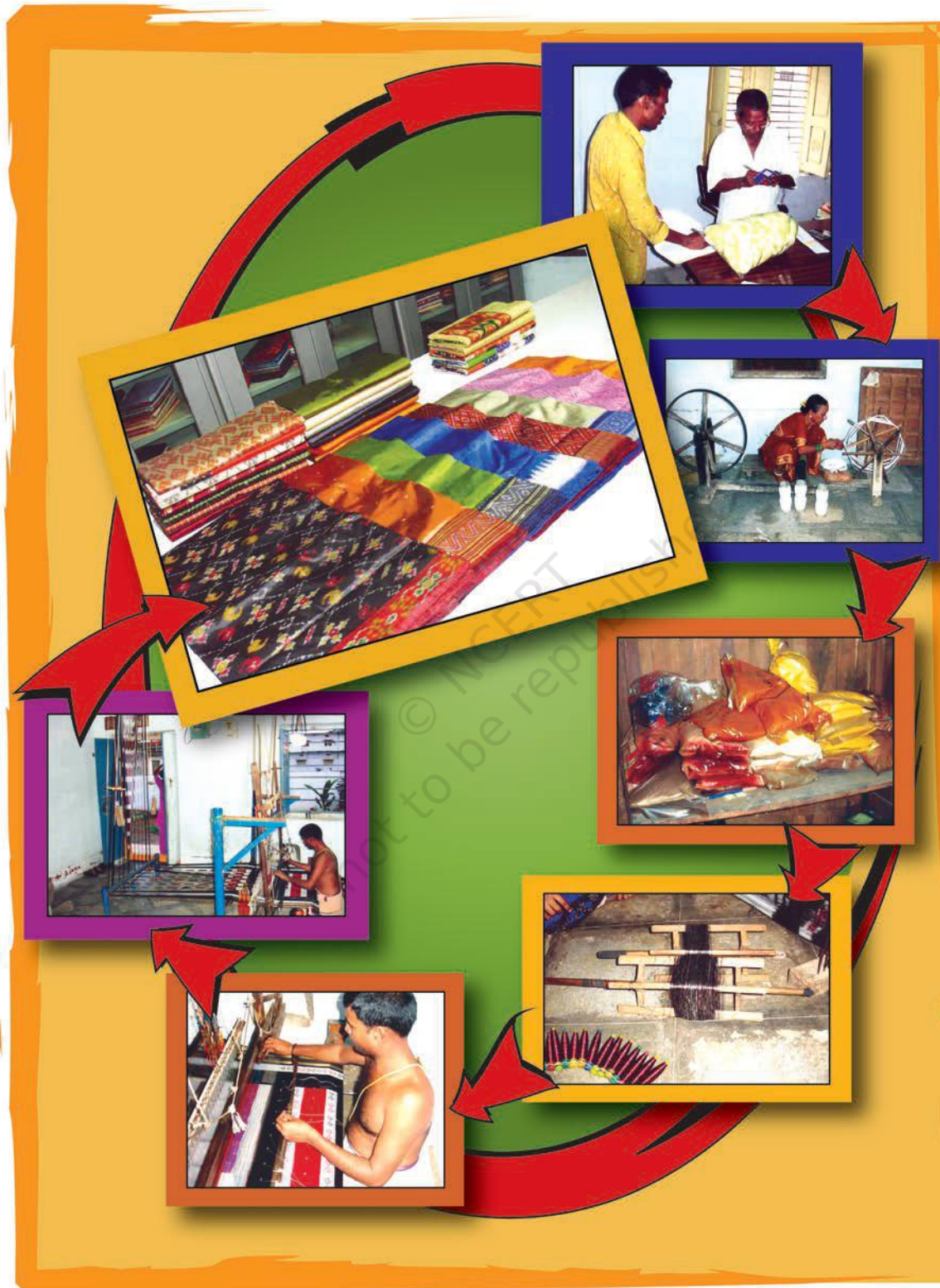
Process of making pochampalli sarees