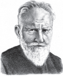
G.B. Shaw 1856-1950

George Bernard Shaw was a dramatist and critic. His work as a London newspaper critic of music and drama resulted in The Quintessence of Ibsenism . His famous plays include Arms and the Man , Candida and Man and Superman . His works present a fearless intellectual criticism, sugar-coated by a pretended lightness of tone. He rebelled against muddled thinking, and sought to puncture hollow pretensions.