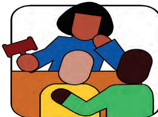
Fig. 20.2: Consumer Protection

The Government of India has accepted, established and enshrined six consumer rights under the Consumer Protection Act (CPA) 1986 . There are four basic rights— (i) right to safety, (ii) right to be informed, (iii) right to choose and (iv) right to be heard. Two additional rights are—right to redressal and right to education.