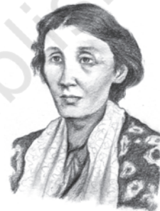
Virginia Woolf 1882-1941

This essay records fleeting impressions and delicate shades of mental experience.