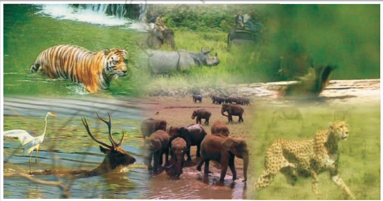
Figure 8.3 : Wildlife

In order to protect them many national parks, sanctuaries and biosphere reserves have been set up. The Government