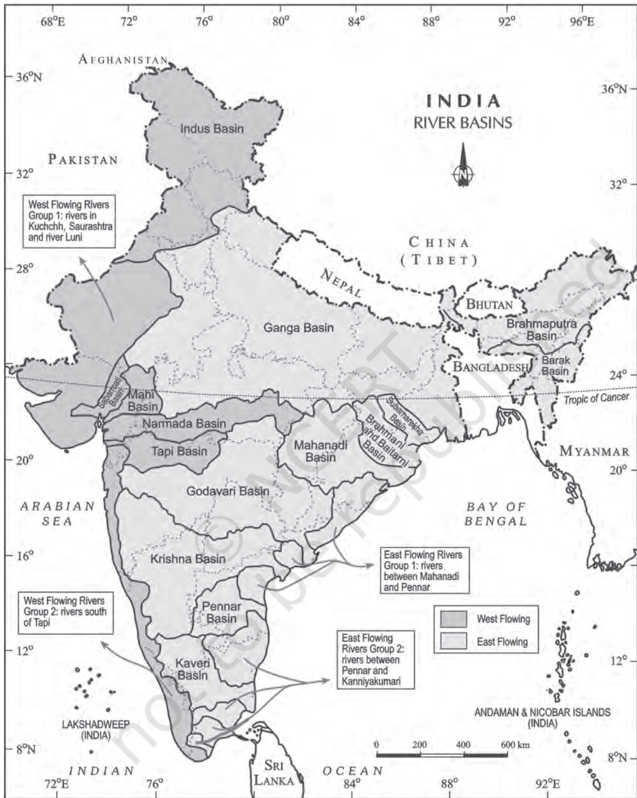
Fig. 4.1 : India – River Basins