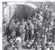
ALL WELLS? There are more than 3,800 declarations or conventions on water, including 285 treaties

There have been more than 500 conflicts over water in the past century, but it's also an agent of cooperation