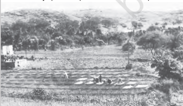
Ralegan Siddhi after mitigation approach

gained employment. Today the village plans to buy land for them in adjoining villages.