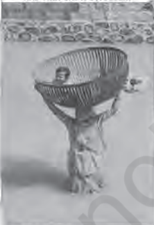
In the Times of Adversity: A woman carries her child to safety in the flooded Hindu village of Rajasthan's Barmer district.