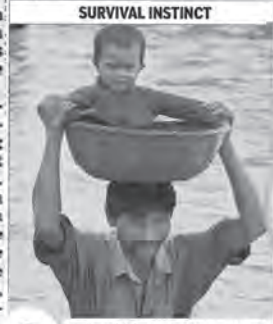
Water Woes: A father carries his son to safety as he wades through floodwater, after a three-day spell of daily rain in Dumbala village, near Sitapur.

Discuss the issues highlighted in the news items.