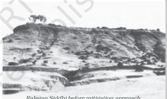
Ralegan Siddhi before mitigation approach

A Rs.22 lakh school building was constructed using only the resources of the village. No donations were taken. Money, if needed, was borrowed and paid back. The villagers took pride in this self-reliance. A new system of sharing labour grew out of this infusion of pride and voluntary spirit. People volunteered to help each other in agricultural operation. Landless labourers also