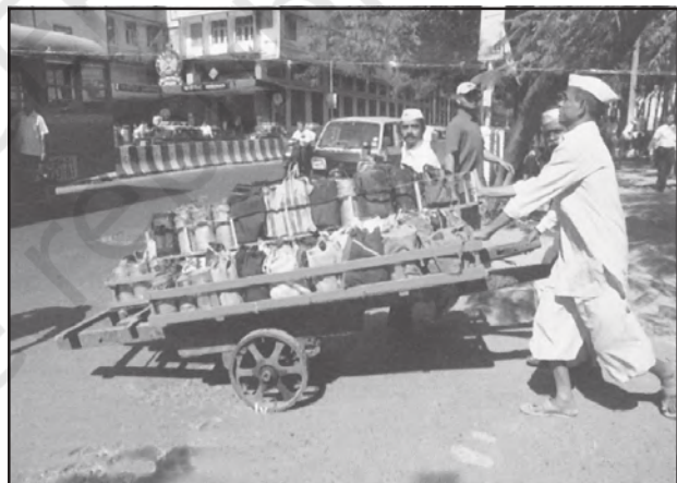
Fig. 6.4: Dabbawala Service in Mumbai

Personal services are made available to the people to facilitate their work in daily life. The workers migrate from rural areas in search of employment and are unskilled. They are employed in domestic services as housekeepers, cooks, and gardeners. This segment of workers is generally unorganised. One such example in India is Mumbai's dabbawala (Tiffin) service provided to about 1,75,000 customers all over the city.