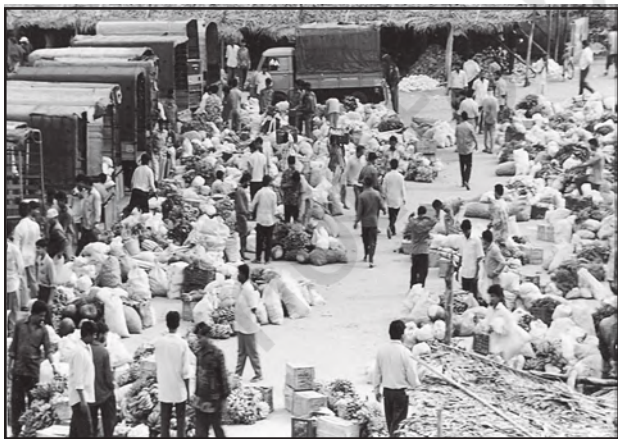
Fig. 6.2: A Wholesale Vegetable Market

Rural marketing centres cater to nearby settlements. These are quasi-urban centres. They serve as trading centres of the most rudimentary type. Here personal and professional services are not well-developed. These form local collecting and distributing centres. Most of these have mandis (wholesale markets) and also retailing areas. They are not urban centres per se but are significant centres for making available goods and services which are most frequently demanded by rural folk.