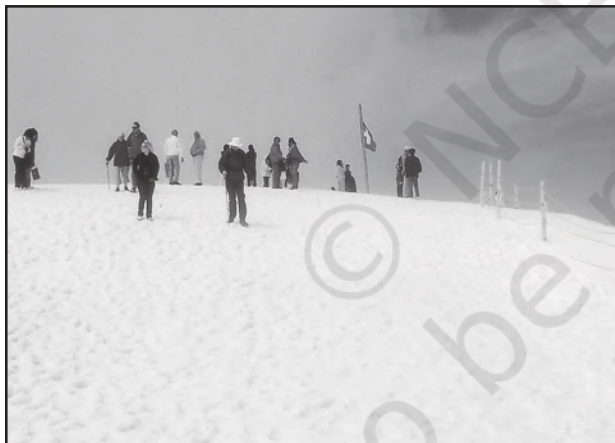
Fig. 6.5: Tourists skiing in the snow capped mountain slopes of Switzerland

Tourism is travel undertaken for purposes of recreation rather than business. It has become the world's single largest tertiary activity in total registered jobs (250 million) and total revenue (40 per cent of the total GDP). Besides, many local persons, are employed to provide services like accommodation, meals, transport, entertainment and special shops serving the tourists. Tourism fosters the growth of infrastructure industries, retail trading, and craft industries (souvenirs). In some regions, tourism is seasonal because the vacation period is dependent on favourable weather conditions, but many regions attract visitors all the year round.