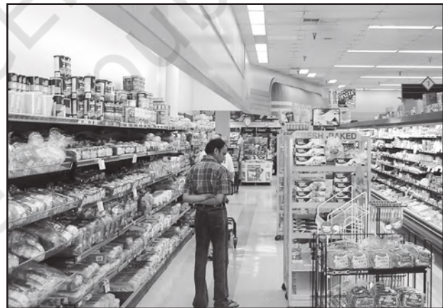
Fig. 6.3: Packed Food Market in U.S.A.

Urban marketing centres have more widely specialised urban services. They provide ordinary goods and services as well as many of the specialised goods and services required by people. Urban centres, therefore, offer manufactured goods as well as many specialised markets develop, e.g. markets for labour, housing, semi or finished products. Services of educational institutions and professionals such as teachers, lawyers, consultants, physicians, dentists and veterinary doctors are available.