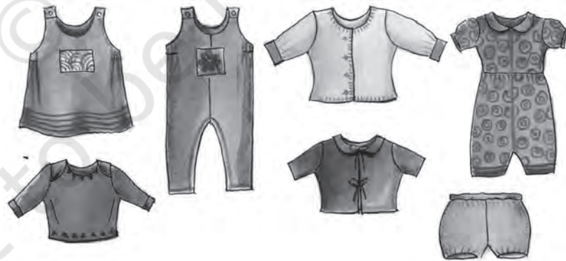
FIGURE 4: APPAREL DESIGNS SUITABLE FOR CRAWLING AGE

Most suitable garments for this age are rompers and sun-suits made from knitted or woven material.