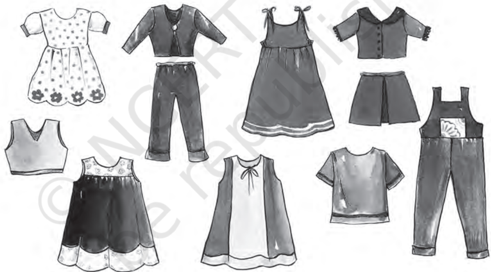
FIGURE 6: APPAREL FOR PRESCHOOLERS

The design features on the ready-to-wear preschooler's dress must provide ease in care. Sometimes dresses have trimmings that make the garment difficult to wash and iron. It should be such that it can withstand many launderings and hard wear. Be sure that fasteners and trimmings are securely attached, decorations are easy to iron, and seams are flat and well finished.