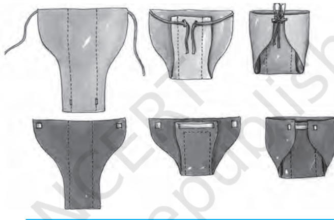
FIGURE 2: PRE-SHAPED DIAPERS

Undershirts are worn in most climates; depending on the weather and geographical location, the material for the undershirt should be selected suitably. Cotton undershirt is suitable for warm climate and soft wool-cotton blend shirts are suitable in cold climate. Usually, shirts and diapers form the basic garments for the infant. Cotton shirts in various styles that slip on easily are preferred.