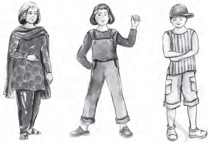
FIGURE 8: COMFORTABLE CLOTHING FOR ELEMENTARY SCHOOL AGE GROUP

To cater to their physical needs the children would require absorbent fabrics so as to absorb perspiration. Most suitable fabrics are cotton, voile, etc. Factors like safety, easy care, growth allowance and suitability to their physique are also important for school going children, just like younger children as has been discussed in the previous sections.