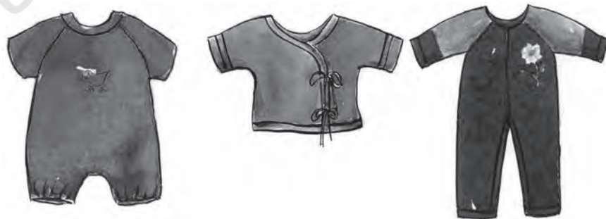
FIGURE 1: CLOTHES FOR INFANTS

Physically at this stage, the baby's skin is very delicate and sensitive and thus would demand very soft, light-in-weight and simple-to-put-on