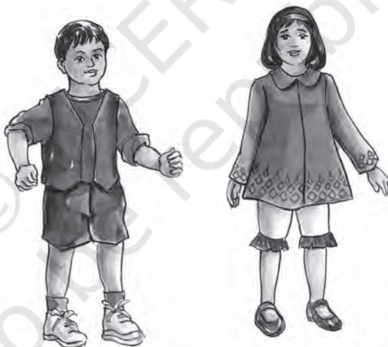
FIGURE 7: SPORTY AND COMFORTABLE DRESSES FOR 5–8 YEARS

They develop likes and dislikes for certain clothes to gain acceptance from their peers, and parents need to understand this developmental change. A sensitive child may experience humiliation and develop lack of confidence if her/his clothes appear very different from those of her/his peers.