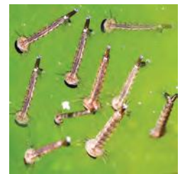
larvae seen through hand lens

Rajat: But flies don't bite. Then how do they spread diseases?