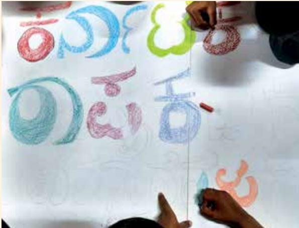
Students working on calligraphy

A lot of thought goes into naming a newly born child, similarly, a lot of effort is put for titles of books, plays, films and awareness campaigns. Letter styles, types and fonts play an important role in promotional materials. Recall various posters you