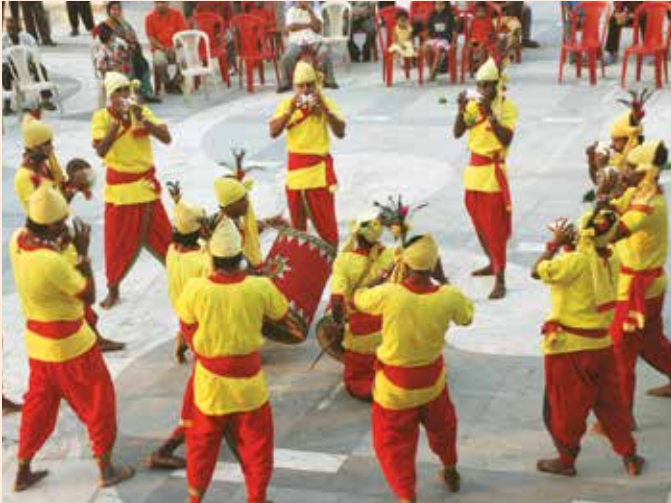
Dances from Chhattisgarh

Keeping in mind your ideas for the performance, look for a folk song from a tradition other than yours. You can research online, or ask musicians and music educators you know. You can even choose from what you have already learnt.