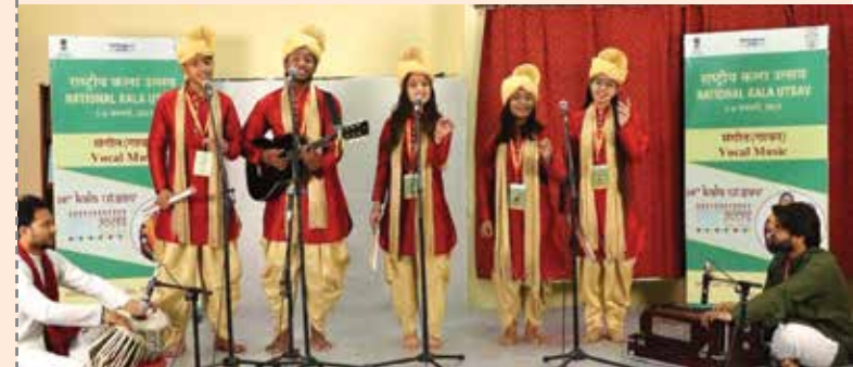
A musical performance in progress

Congratulations! You are now a young performer!