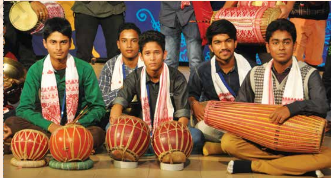
Orchestra from Assam — Kala Utsav