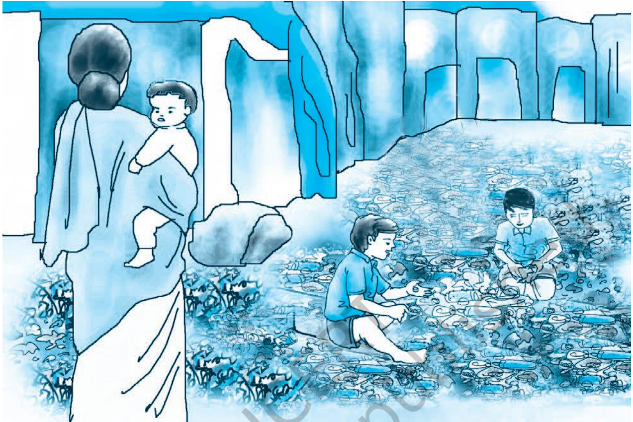
Fig. 10.3 : Children playing with waste material

Through this activity you will be surprised to find that many of the items that have been discarded by you, still have utility. On the other hand, there are certain wastes, such as wet waste (kitchen waste), which can be reduced to almost 'zero waste'. Let us now discuss how we can reduce the volume of solid waste and garbage, by practising waste management and segregation through the principles of "reuse, recycle, reduce and refuse."