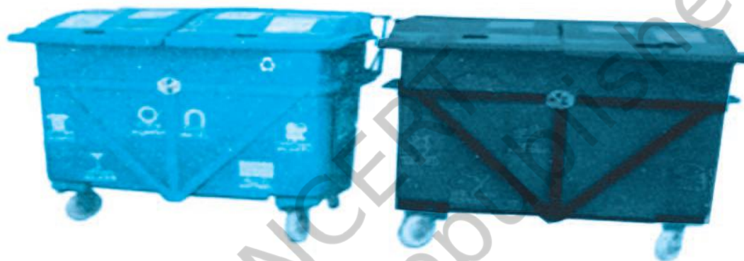
Fig. 10.4 : Blue and Green Bins

In the cities we find these bins in some places, where people can dispose of biodegradable and non-biodegradable garbage separately. Where do you think we should dispose of hazardous waste? Should there be a separate bin for it? Why?