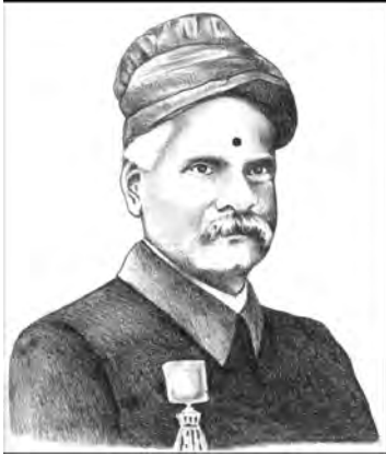
Raja Ravi Varma

You can see the many diverse levels that cultural change, resulting from our colonial encounter with the west, took place. In the contemporary context often conflicts between generations are seen as cultural conflicts resulting from westernisation. Have you seen this or faced this? Is Westernisation the only reason for generational conflicts? Are conflicts necessarily bad?