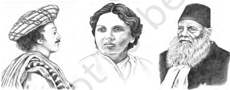
Raja Ram Mohun Roy Pandita Ramabai Sir Syed Ahmed Khan

You have already seen the far-reaching impact of colonialism on our lives. The social reform movements which emerged in India in the 19 th century arose to the challenges that colonial Indian society faced. You probably are familiar with what were termed social evils that plagued Indian society. The well-known issues are that of sati , child marriage, ban on widow remarriage and