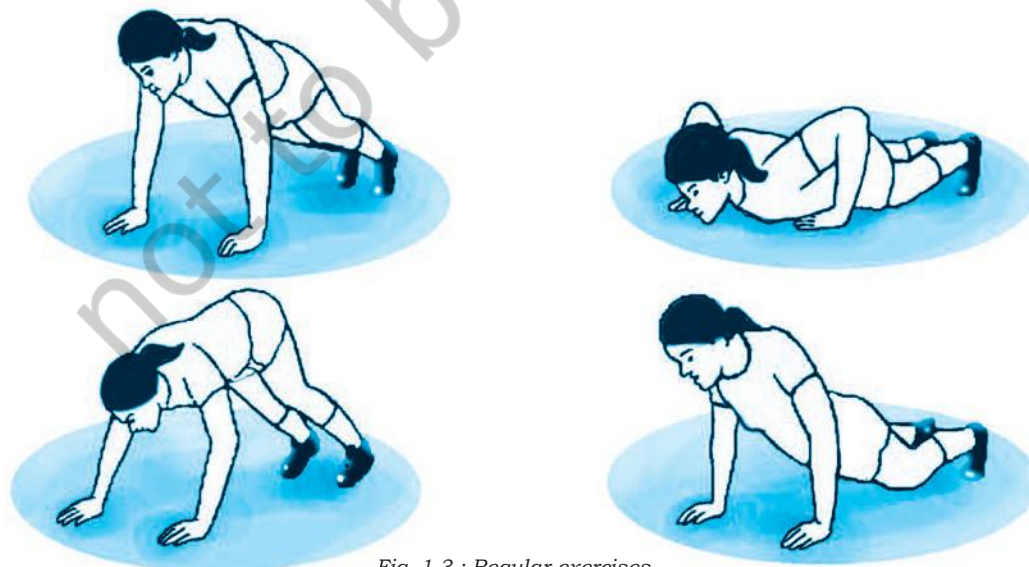
Fig. 1.3 : Regular exercises