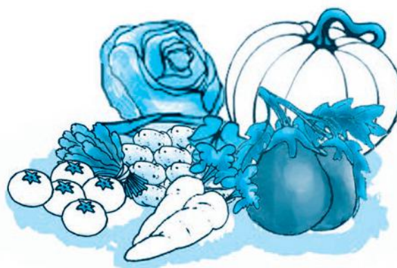
Fig. 1.2 : Healthy Diet

One must do 20–30 minutes of physical activity daily to keep fit. This can be done by taking part in sports. Exercising or spot jogging can be done at home. Simple walking, climbing stairs, not using the lift and skipping have the same effect. Gym is another dedicated place for workouts.