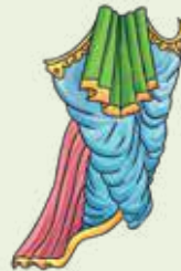
Dhoti for Krishna character