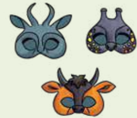
Masks for animals