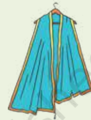
A blue dupatta to symbolise the river