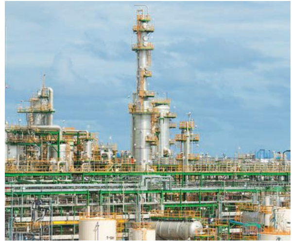
Fig. 7.15. Petrochemical plant

Startup A startup is an entrepreneurial venture with limited resources that aims at rapid growth and expansion while leveraging technology.