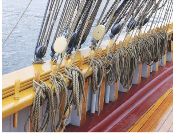
Fig. 7.21. Pulley used in boats

Now, let's look at examples of how technology is helping students learn, build new skills, and find jobs.