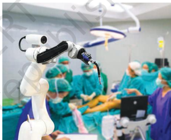
Fig. 7.19. Robots assisting in surgical processes

Have you noticed how old technology gets replaced by a new, better one?