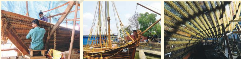
Fig. 7.9. Re-creation of a 5 th -century stitched ship

Indians used a unique stitching technique dating back over 2000 years to make ships and boats, which they used to conduct maritime trade and cultural exchanges across the Indian Ocean. The technique involved stitching wooden planks together using cords instead of nails, which made them flexible and helped the ships navigate the Indian Ocean with ease.