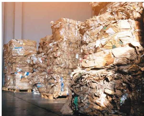
Fig. 7.25. Use of recycled products as inputs