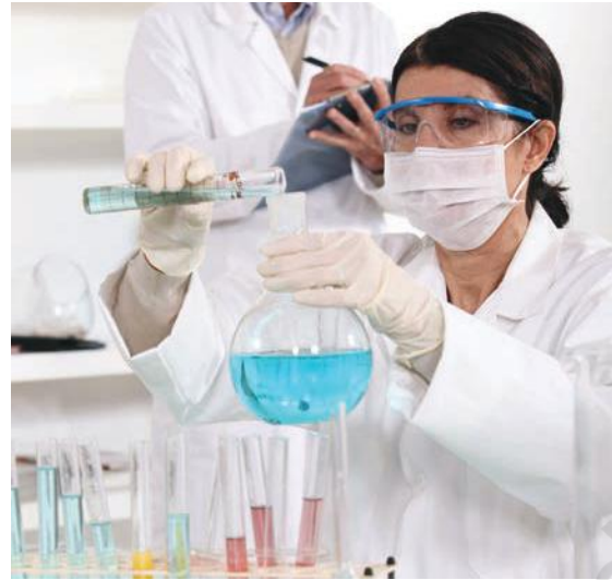
Fig. 7.4. Chemical engineer