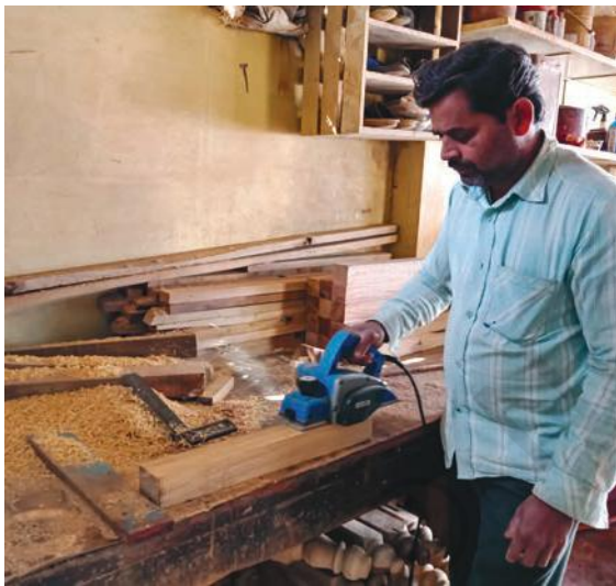
Fig. 7.5. Carpenter