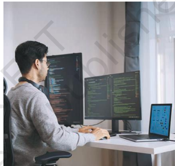
Fig. 7.6. Software developer

a good job. The word labour refers to the physical and mental effort used in production. However, human capital refers to the specialised skills, knowledge, abilities and expertise required to perform that labour. Thus, human capital is not just the basic efforts of labour but also the quality and efficiency of that labour.