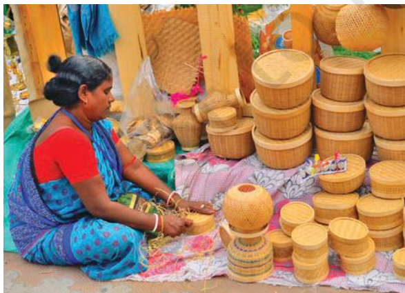
Fig. 7.12. Bamboo and cane products, Arunachal Pradesh

Entrepreneurship means starting your own business or creating something new to solve a problem. An entrepreneur is a person