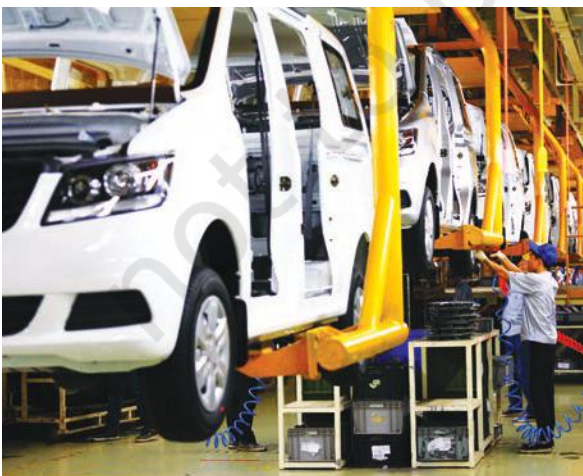
Fig. 7.10. Machinery

Capital is essential to a manufacturing unit or a services sector enterprise. But where do businesses get the capital? Generally,