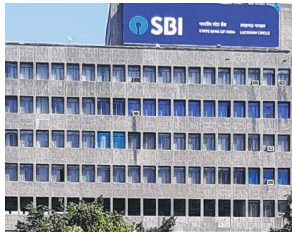
Fig. 7.11. Loans