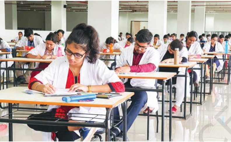
Fig. 7.8. Students writing an exam

According to the Economic Survey of India 2024, 65 per cent of people in India are below the age of 35 years. This means that India has a young, productive population, which may help the country reap the benefits of a demographic dividend. The demographic dividend refers to the benefit a country gets when it has a large number of young and working people. When more people are working and earning, and fewer people depend on them, the country can grow businesses and improve living standards. To take advantage of this potential, individuals must have access to quality education, health, training, and skilling, which would contribute to the nation's progress. You will learn more about this in the year ahead in the chapter on Demographics.