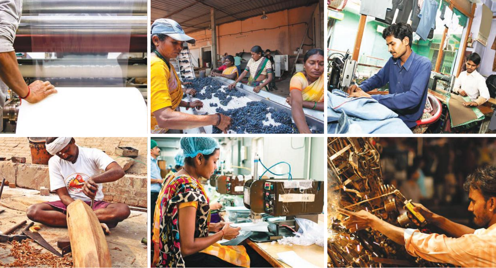
Fig. 7.2. A glimpse at the production of some goods