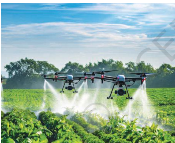
Fig. 7.18. Drones spraying fertilisers to improve crop health

Today, newer and advanced technological developments are applied in various areas, making our lives easier. For example, payments can be made at the click of a button through UPI (Unified Payments Interface); farmers can get advance weather updates; Global Positioning Systems (GPS) can discover the shortest routes for transporting goods, and so on.