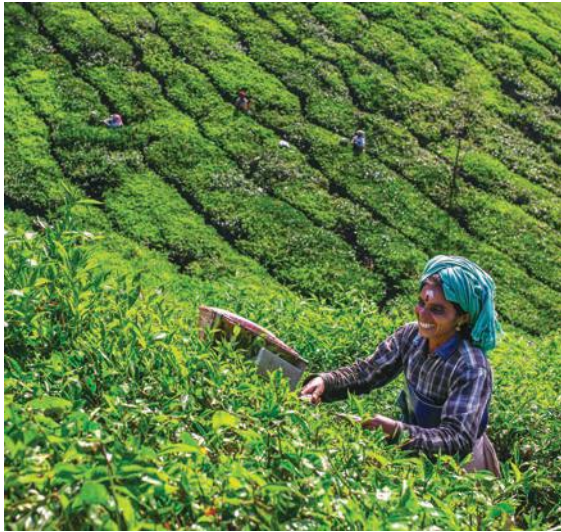
Fig. 7.3. Worker at a tea plantation