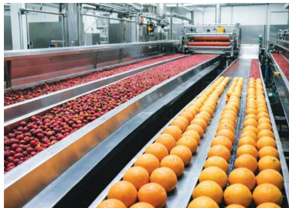
Fig. 7.13. Food processing