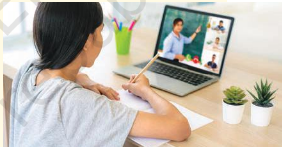
Fig. 7.22. Online learning