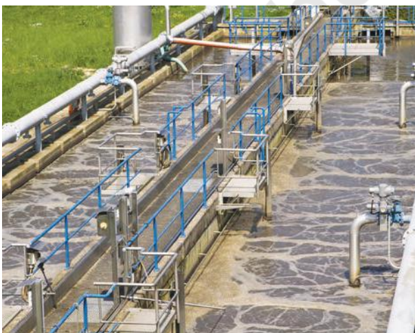
Fig. 7.24. Recycling industrial wastewater before releasing it into water bodies

So, it is important for producers to adopt sustainable practices to replenish natural resources for future use.