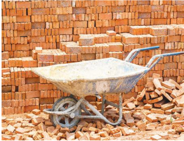
Fig. 7.20. A wheelbarrow on a construction site