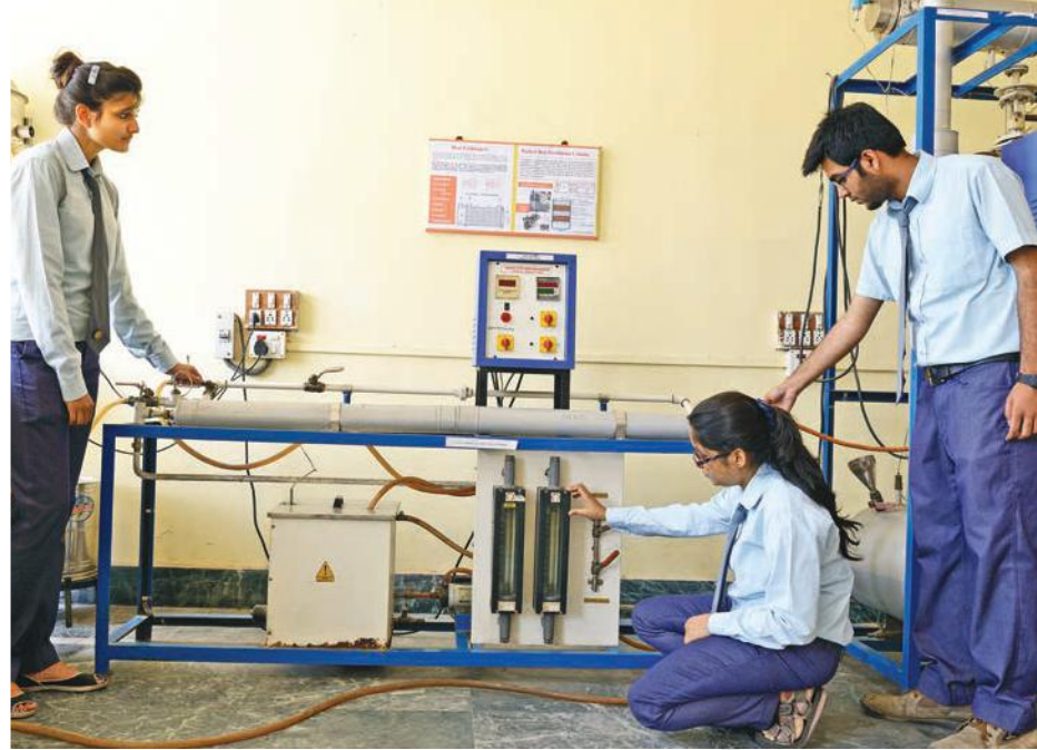
Fig. 7.7. Education and training