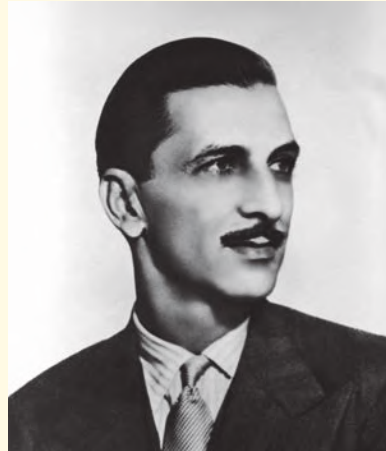
Fig. 7.17. J.R.D. Tata

Jehangir Ratanji Dadabhoy (J.R.D.) Tata was one of India's greatest entrepreneurs and played a big role in building modern India. He was born in 1904 and became the head of the Tata Group, one of the largest business groups in the country. He believed that businesses should not only make money but also help society. He started India's first airline, Tata Airlines, in 1932, which later became Air India. Under his leadership, the Tata Group expanded into many areas like steel, cars, power, and chemicals. J.R.D. Tata was also known for caring about his workers and believed in providing them with good working conditions. He was a man of vision, hard work, and honesty. In 1992, he received the Bharat Ratna, India's highest civilian award, for his great service to the nation.