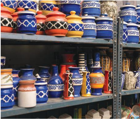
Fig. 7.14. Pottery products, Delhi