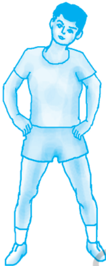
1. Head tilt (side to side)

Warming Up: Muscle stiffness is thought to be directly related to muscle injury and therefore, the warming up should be aimed at reducing muscle stiffness.