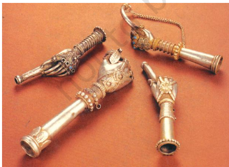
Utility items in metal from different parts of India, eighteenth–nineteenth centuries