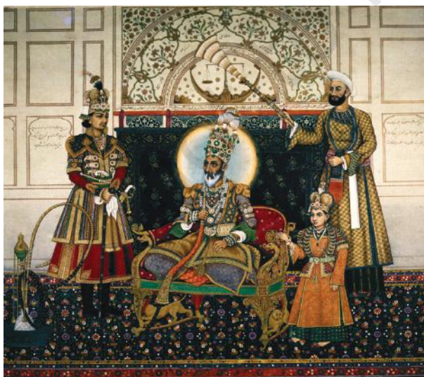
Durbar of Bahadur Shah Zafar