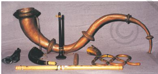
Wind instruments, Himachal Pradesh

There are a variety of pipes, long telescopic ones known as shanal or karnal and the 'S'-shaped curved trumpet known as narasingha . These are made by local metal-smiths who are often attached to the temple.