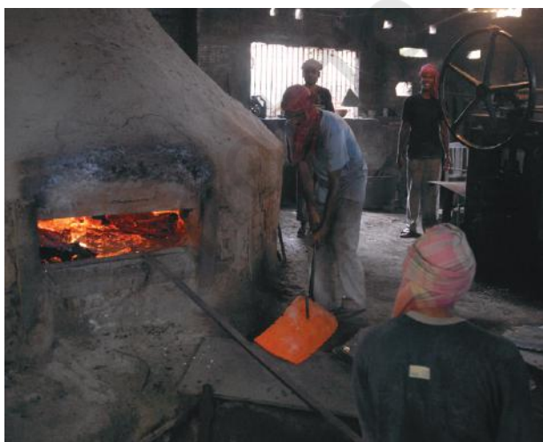
Inside a metal worker's studio

We could not imagine a wizard's cavern more fascinating than our wheelwright's workshop. Its furnaces, big one and some smaller ones, were a great attraction. What interested us most about these furnaces was the intense glow the coal gave when the bellows worked. It was also engrossing to watch the red hot metal bars hammered into shape. Cascades of sparks flew as from a fountain of fire. It was like fireworks at the Diwali festival! It took our breath away to see the bullocks shod with iron hoofs and the cartwheels fitted with iron bands and then dipped into water. How the sizzling steam came out — vapour coloured by the light of the furnaces!